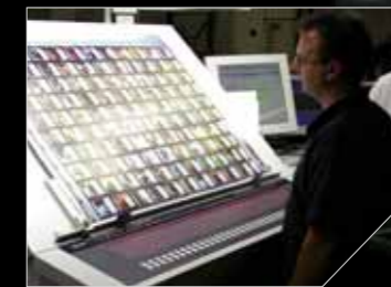
Cards on the table. EVE: The Second Genesis is already at the printing stage and is available to pre-order right now