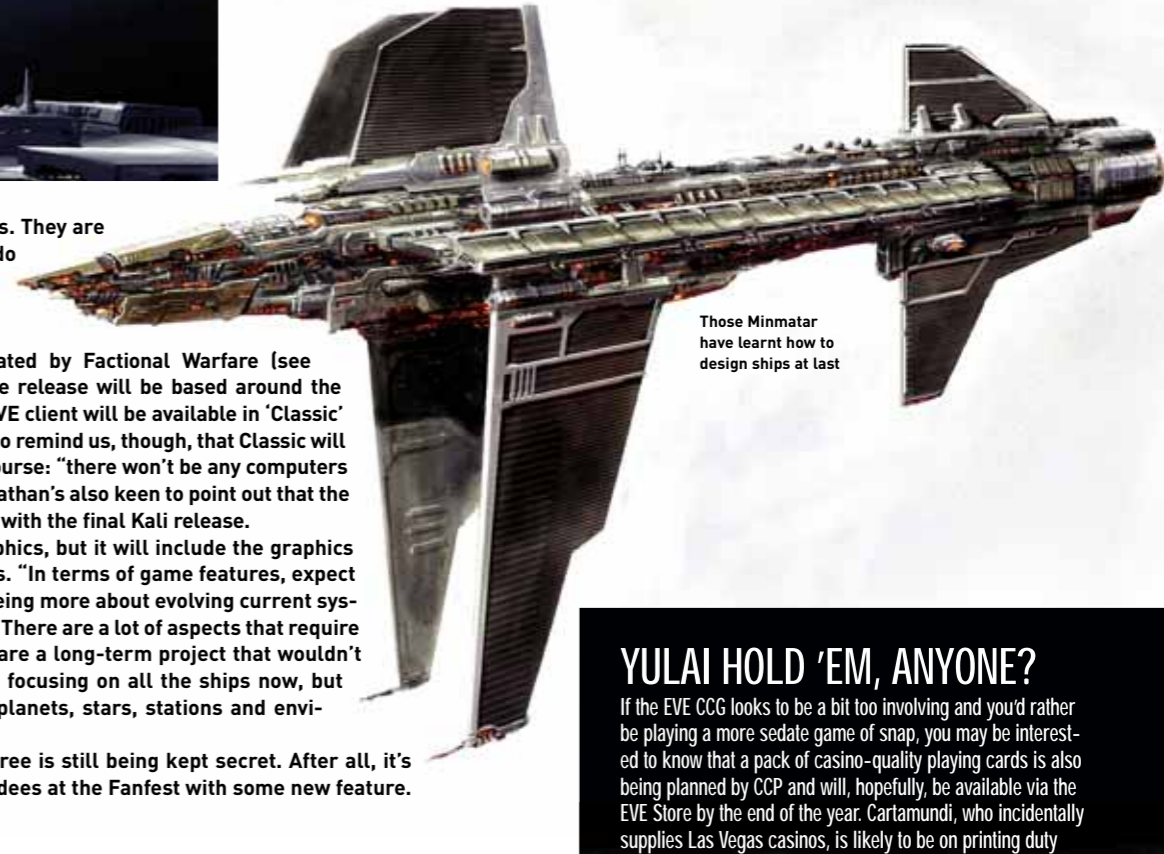
Those Minmatar have learnt how to design ships at last

We suspect much about Stage Three is still being kept secret. After all, it's traditional for CCP to surprise attendees at the Fanfest with some new feature.