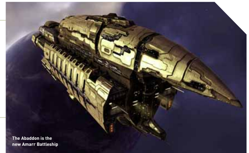
The Abaddon is the new Amarr Battleship

combat reorganisation, which are revamped tools designed to allow better situational awareness. There'll be a seamless zoom going from your ship to the universe level, where a scoot on the mouse wheel will see your ship pull away and moons, stars, constellations and then entire regions fill the screen. This feature will go hand-in-hand with the updated system scanning required for exploration - part of the revamp to mini-professions [see Career Paths , page 42].