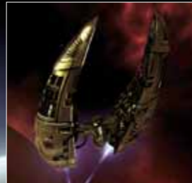
The ultra hi-res ships will be introduced next year, but they're not strictly a Kali feature