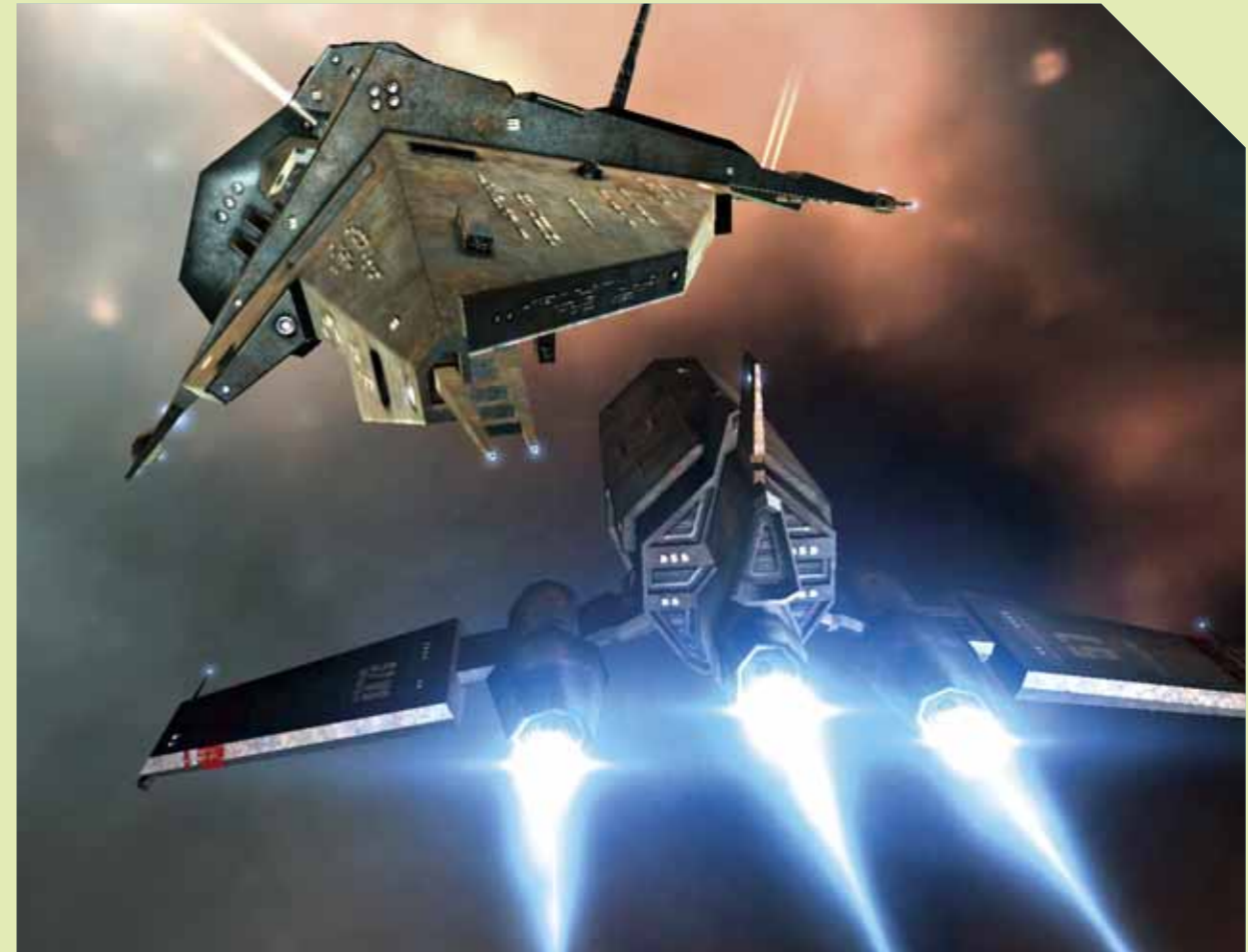
Rigs provide useful little boosts to everything from speed to weapon output. Just bear in mind that not all rigs are cost-effective in ISK and CPU terms

So what's the catch? Likened more to implants than modules, rigs cannot be unplugged without destroying them. Also, a lot of rigs have drawbacks to balance out their benefits, making them useful on only very specialised ships. Drawbacks can be reduced by training the appropriate skill, Armour Rigging, for example, reduces the drawback for armour rigs by 10% per level. Tech I ships, including capital ships, all get