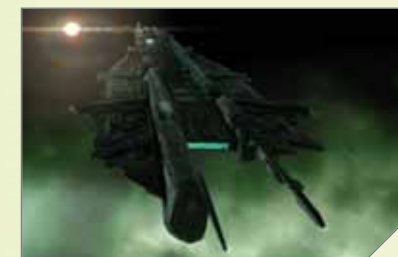
Looking for mercenary help? BDCI is a good starting point. They kill with style and attitude

Such is the respect gained that even victims, upon re-awakening in their clone chambers, have been left in awe. So much so that several clients have in fact been former targets