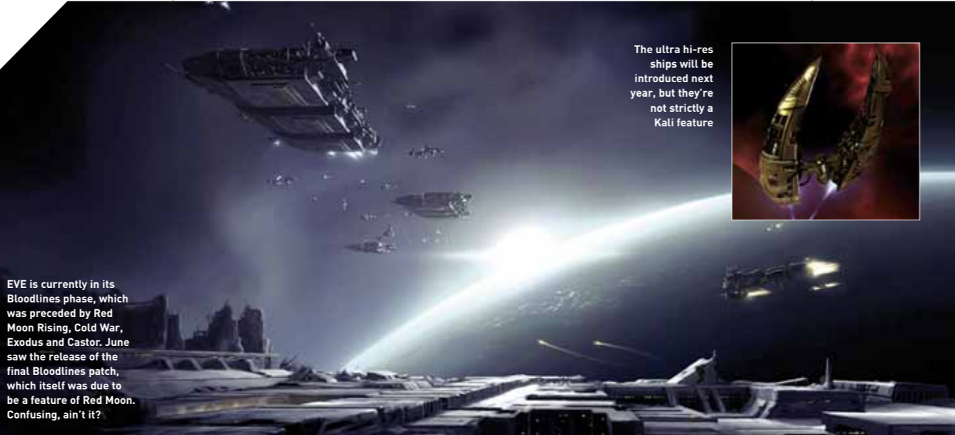
EVE is currently in its Bloodlines phase, which was preceded by Red Moon Rising, Cold War, Exodus and Castor. June saw the release of the final Bloodlines patch, which itself was due to be a feature of Red Moon. Confusing, ain't it?

One of the most interesting features due for Stage One is